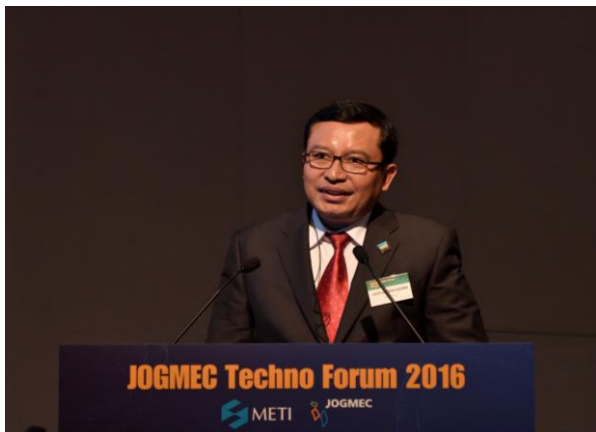
Dr. I Gusti Suarnaya Sidemen Ministry of Energy and Mineral Resources, Indonesia Way forward for oil & gas development in Indonesia (On behalf of Dr. Djoko Siswanto), Promoting Sustainable Oil and Gas Production in Indonesia: The role of CCS and CCUS