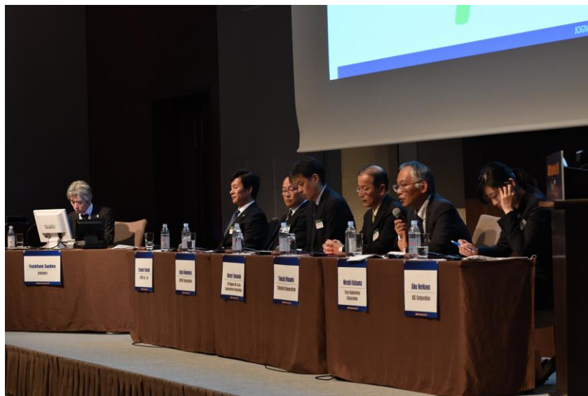
Day 2 Technical Discussion: Cost Reduction, Efficiency Enhancement, and Alliance ~Technologies and Actions to be pursued~