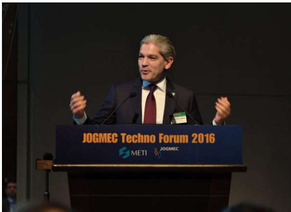
Dr. Aldo Flores-Quiroga Ministry of Energy, Mexico The opening of the Mexican oil and gas market