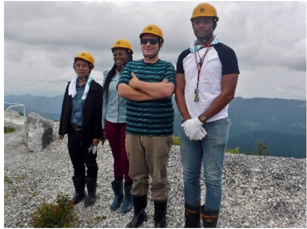
Visiting Torigatayama Quarry Complex