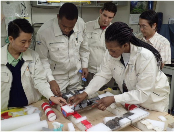
Sample processing on R/V Hakurei