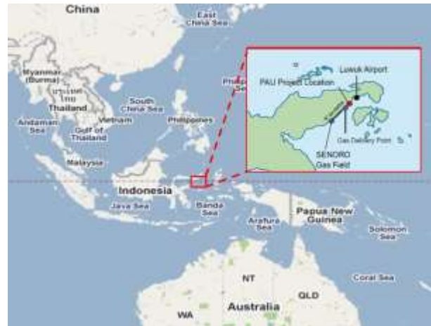
Map of Sulawesi